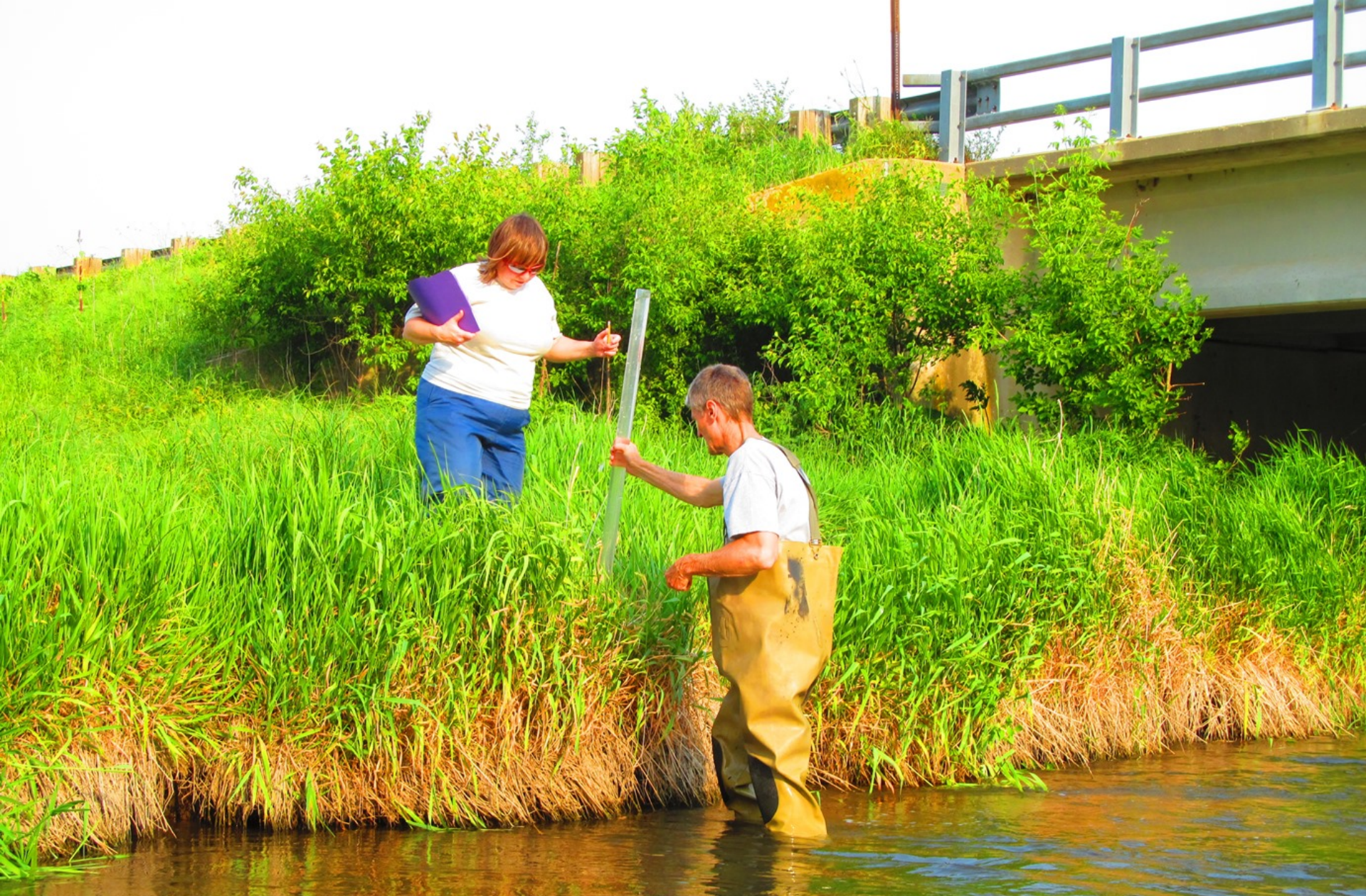
1996: Water Action Volunteers